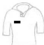
Cricket Shirt ( W/B )