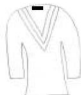
Cricket Jumper ( W/B )