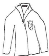
Coat ( N/P nametape on collar)