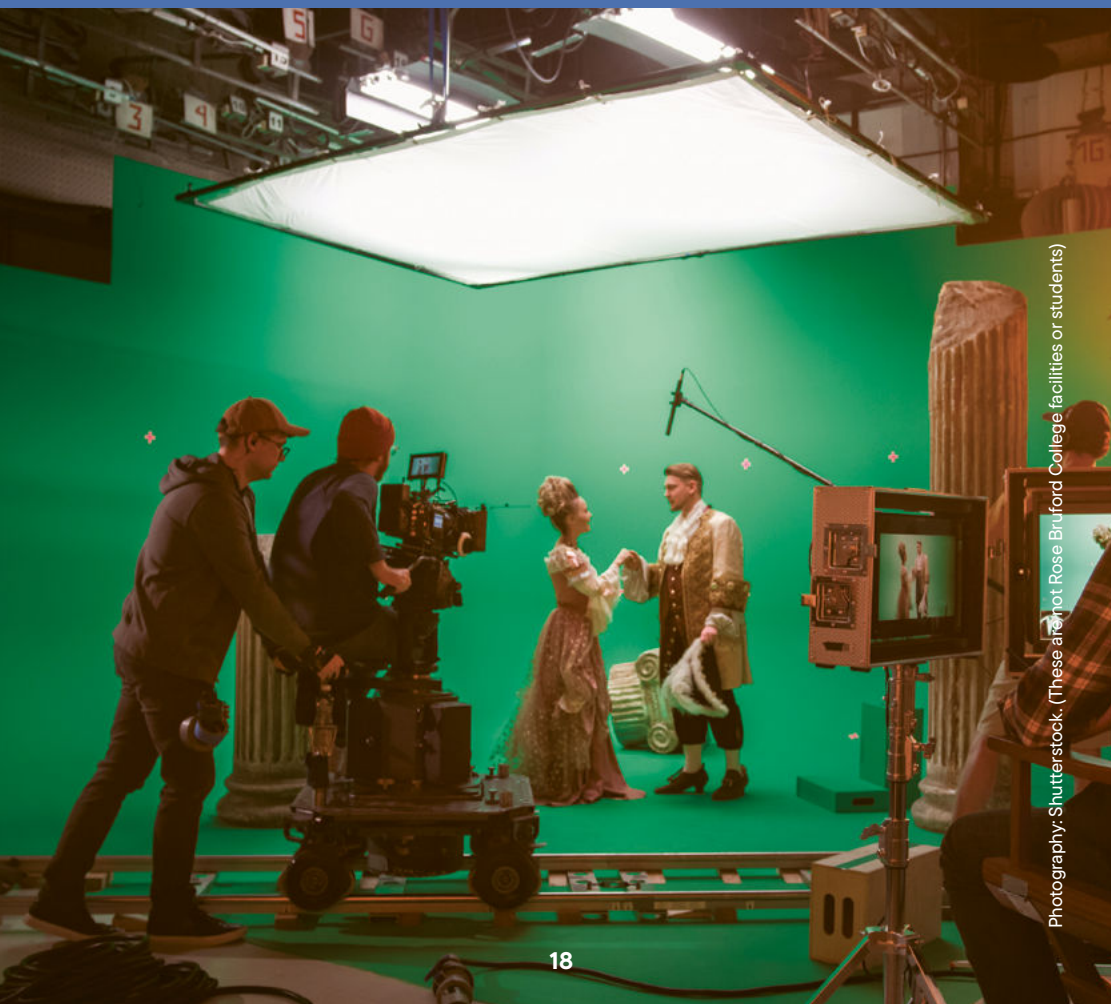
(These are not Rose Bruford College facilities or students)

An innovative, intensive actor training programme designed to hone your acting talent and develop the skills needed to create your own work across all media: live, digital, audio, and screen.