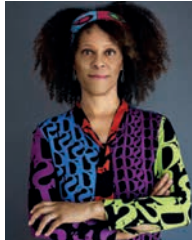
Bernardine Evaristo, OBE