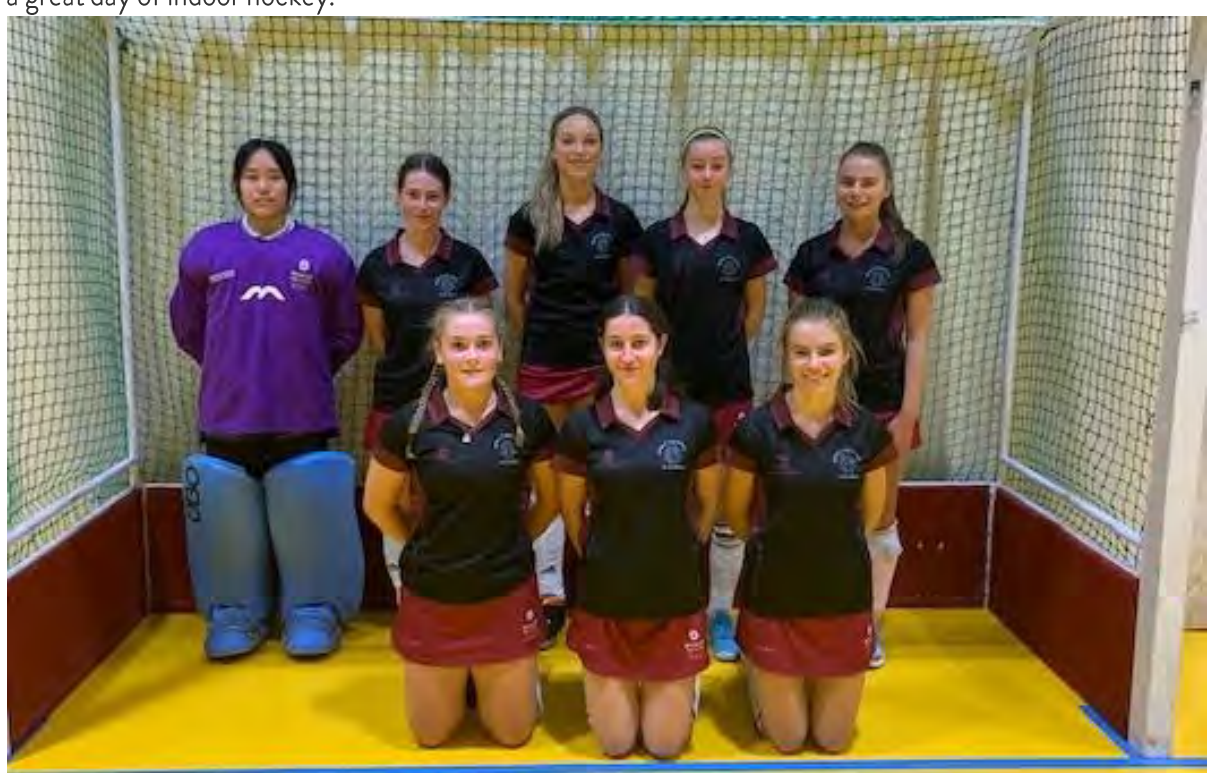
Girls U'18 Kent Indoor Hockey 3<sup>rd</sup> Place 2021-22

Back to outdoor hockey, at the Regional Finals we took on Croydon High, Cranbrook and Caterham (which was one of my favourite matches of the season). As all 4 teams had already progressed from their County Championships both the standard and the stakes were high. Every match counted - only the top placed team would go to the Nationals. The tournament was held on a Wednesday afternoon which meant that despite the cold weather most of Caterham's 6th form was on the terraces to watch which added to the excitement. Our 1st match of the day against Croydon High was a solid 4-0 win.