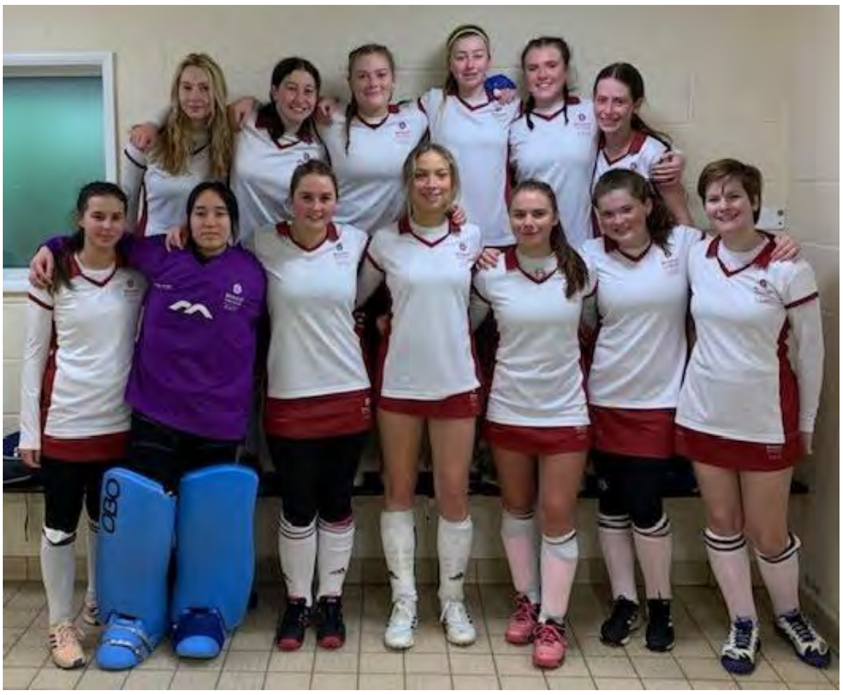
Girls U'18 Tier 4 Regional Hockey Champions 2021-22

February finally arrived and it was time to head to Nottingham in our smart new kit. Most of the team had already had the honour of playing in the U16s National Finals when we took home the bronze medals. But now was the time to firmly put Bromley High School's name on the champion's board.