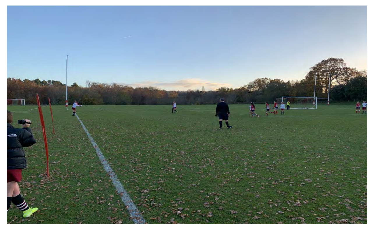
U'15 vs Sevenoaks school – 2<sup>nd</sup> Round ISFA National Cup (won 3-0)

In the ISFA cup we dominated in many of our matches. In the quarterfinals we beat St Joseph's college an astonishing 10-0. When we reached the semi-finals, we unfortunately lost to Surbiton High 3-1. It was a close game despite the lack of training at the time due to teacher strikes. There was a great display of determination in all the girls, and I couldn't be prouder of them. We have some outstanding players coming through from both year 10 and year 9. I have confidence that next year we will be more successful than this year and I can only hope there is more football at this school in the future.